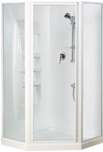
Note: Tapware and accessories illustrated in photography are not included

Available in a range of sizes and wall options, the Sapphire Angle Corner Shower is extremely versatile. Features a fully reversible door with 4mm toughened safety glass, and full length magnetic door seals. The Quick-Fit® tray features the ultra high 40mm upstand to enhance water tightness for long lasting performance.