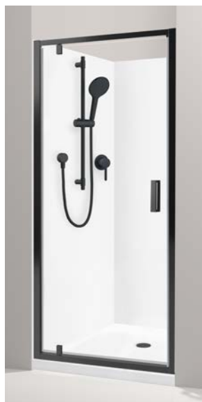
Note: Tapware and accessories illustrated in photography are not included

The Valencia Elite Alcove Pivot Shower combines exceptional performance with ease of installation. Beautifully engineered, this shower is available in a range of finishes, sizes and wall options. The enclosure features a fully reversible door boasting 6mm toughened safety glass with Englefield CleanLess® glass treatment. The Quick-Fit low profile tray features an ultra high 40mm upstand for maximum watertightness, ensuring long lasting performance.