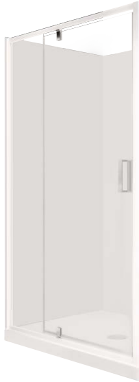
Note: Tapware and accessories illustrated in photography are not included

The Valencia Elite 1200mm Alcove Pivot Shower combines exceptional performance with ease of installation. Beautifully engineered, this shower is available in a range of finishes and wall options. The enclosure features a fully reversible door boasting 6mm toughened safety glass with Englefield CleanLess® glass treatment. The Quick-Fit low profile tray features an ultra high 40mm upstand for maximum watertightness, ensuring long lasting performance.